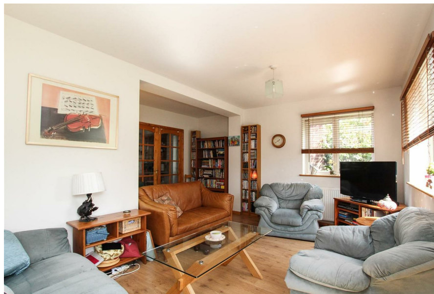
9 Philip Close, Pilgrims Hatch, Brentwood, CM15 9NT

An EXTENDED semi detached house, situated in a pleasant cul de sac in the popular Pilgrims Hatch area of Brentwood. Having benefited from a double storey extension to the rear, this excellent family home offers spacious, well-planned accommodation. An entrance hall gives access to the fitted kitchen and dining room with double doors leading to the lounge which occupies the width of the house to the rear and overlooks the lovely south facing rear garden. From the kitchen you access a useful utility area, comprising a cloakroom, storage area and what is currently used as a home gym. To the first floor are four bedrooms, with ensuite to master and further guest bathroom. Offered with no onward chain.